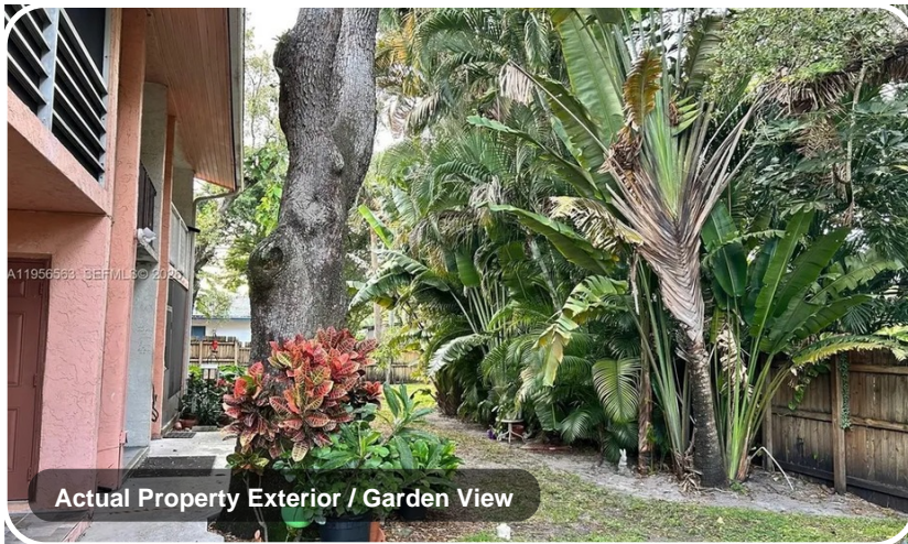
Actual Property Exterior / Garden View